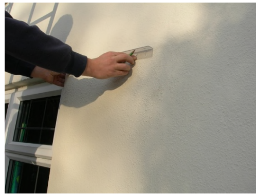
3. Position bracket on wall