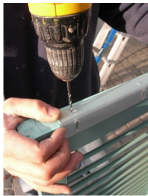
2. Drill pilot holes for fixing screws