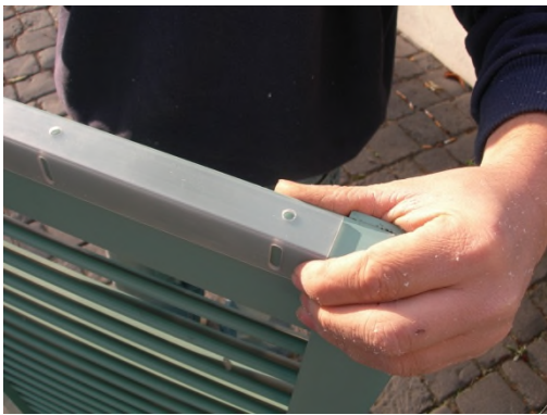
1. Position Bracket on shutter