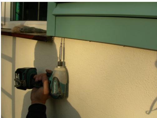
9. Insert screws to secure shutter to bottom bracket