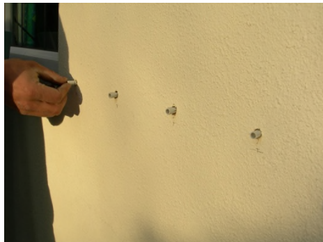
6. Insert wall anchors