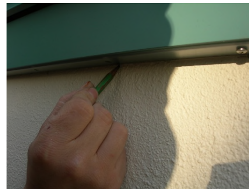
11. Finished installation

Town & Country ‘synthetic wood’ step by step installation guide [hidden brackets only]