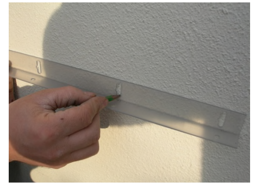
4. Mark wall bracket fixing points