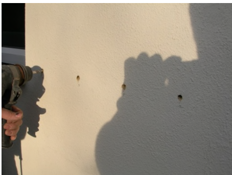
5. Drill holes in wall